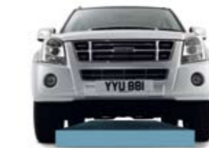
Ground clearance 205mm