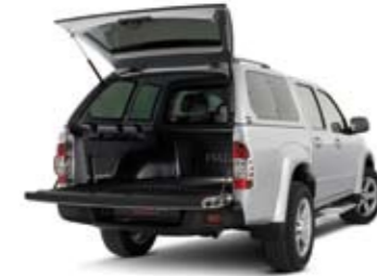
Denver Max LE load dimensions: Length 1,350mm Width 1,340mm Height 940mm (At highest point)