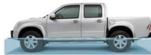
Wading depth 600mm @ 5km/h