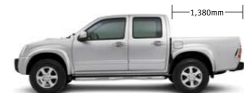
Denver 5,035mm Denver Max & LE 5,080mm