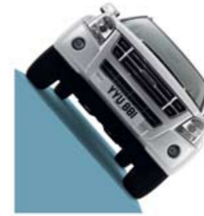
Maximum traverse angle 49°