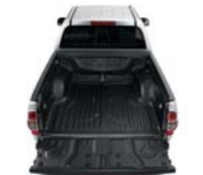
Denver Max load dimensions: Length 1,360mm Width 1,340mm Height 450mm