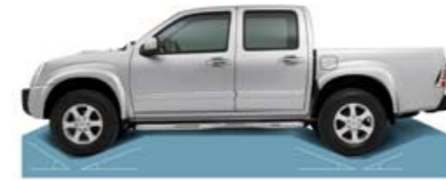
Approach 34° Departure 21° Ramp 21°

You like to challenge the boundaries. Well here's a pick-up that will keep up with your pace. You can explore with free abandon and take on the toughest work site. Twin airbags plus ABS with EBD for extra stability will keep you glued to whatever surface is underneath you. The road, the Rodeo and you. It's a formidable combination.