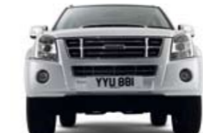
Track: Front 1,520mm Rear 1,525mm