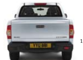
1,235mm 1,800mm (Width excluding wing mirrors)